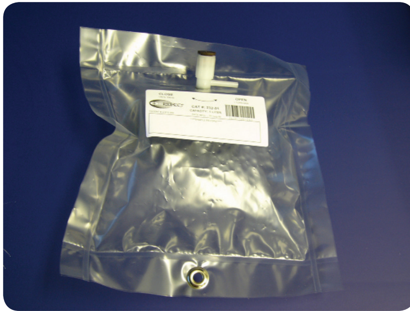
Correctly Inflated Tedlar Bag